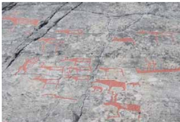
Fig. 3. Alta, Post 11: 4200-4200-3600 A scene of hunters both from the land and sea with images of reindeer, elk, and bears. The images may have meanings that are both individual and in connection with each other.