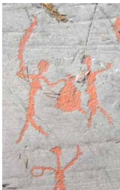
Figs. 4a and 4b. Alta Post 11: 4200-3600 BC. The rock art image on the left shows two people possibly holding a bird, while the person in the foreground might have a drum. If so, drums might have been used in the area up to 8000 years ago. The photo of a Sami drum from the University of Tromsø, Norway Museum on the right shows similar images as those found in the carvings including a bird like figure in the upper left. More research has to be done to truly state that the carvings were done by the ancestors of the Sami.