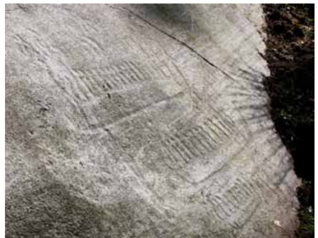
Fig. 5a and 5b: Tanum, Sötetorp T-356:1 Ship images in natural light (approx. 15:00) and a frottage of the same images. The ships are ca. 900-700 BC, the lowest one currently lies just a few centimeters above the ground level.