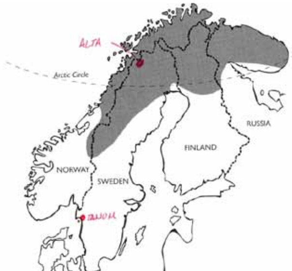
Fig 2. Location of Alta, Norway above the Arctic Circle and Tanum Sweden to the south.